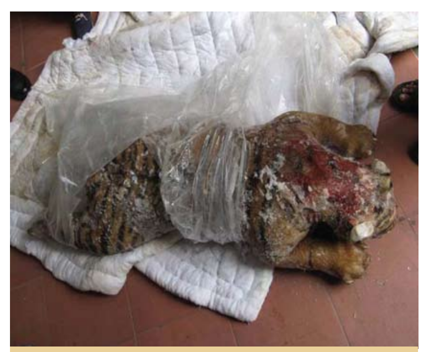
Tiger farms and private zoos are an ideal cover for illegal trade. Captive born animals and those that die in captivity can be sold on into the illegal trade

If the Ministry of Agriculture and Rural Development is truly concerned about the need to know tiger population numbers in preparation for the day that wild estimates reach zero, then this form of tiger breeding initiative MUST be carried out under the direct supervision of a government institution. This would ensure breeding management for conservation, the accountability of offspring with deaths and disposal properly documented.