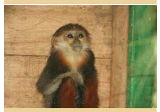
A local resident in Hue voluntarily turned over this redshanked douc langur to authorities. The animal was later transferred to Phong Nha Rescue Center.