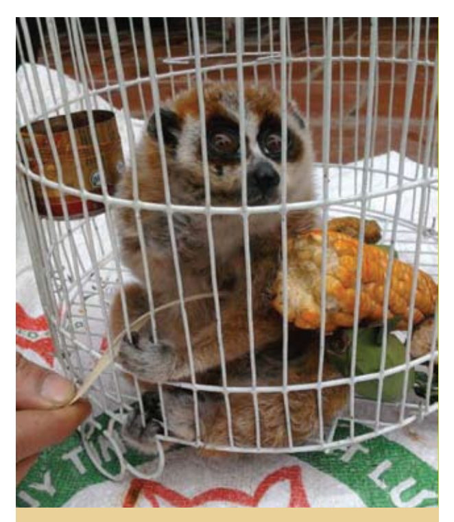
A loris recovered from the trade shortly before it was released into Ba Vi National Park

On March 10, local police confiscated a northern white-cheeked gibbon (Hylobates concolor leucogennys) from a local resident. The owner claimed he and his friends had just caught the gibbon nearby. The gibbon was transferred to the Cu Chi Rescue Center. (Case ref. 3270/ENV)