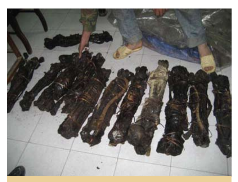
Hanoi Economic Police recently confiscated 12 dried douc langurs. The langurs were discovered in a private car that allegedly transported the animals from Dak Lak and was heading for the Chinese border.

A: By continuing to violate the law after receiving warnings and fines, the restaurant owner is sending a message to local authorities saying that he does not respect the authorities and the law. This is a perfect case to make a good example of. If repeated fines do not work, discuss revoking the owner's business license for engaging in repeated violations of the law. Increase the frequency of inspections and maximize fines that can be issued. It is critical to get these defiant violators to comply with the law as their lack of compliance also encourages others to engage in illegal activities.