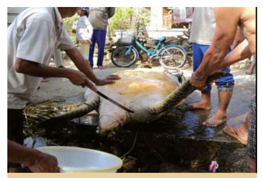
A marine turtle shortly before it was killed and decapitated by local residents of Nui Thanh district in Quang Nam Province.

On January 10, Thanh Hoa authorities arrested a man for