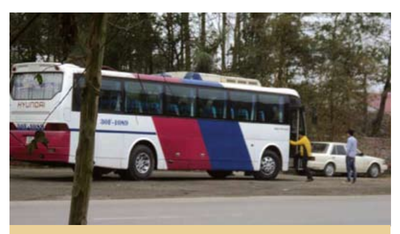
Not long before the new instruction was issued by the Ministry of Culture, Tourism and Sports, ENV investigators observed buses of Korean tourists continuing to enter bear farms in Quang Ninh during February 2011.

Bear bile tourism operations involve tour agencies taking groups of foreign tourists, mainly Koreans, to bear farms where they witness a bear bile extraction and then are encouraged to buy bear bile, which they then smuggle out of the country in violation of CITES. Exploitation and sale of bear bile is illegal according to the law. Such tourism operations, most prominent in Quang Ninh province, but also found in Ho Chi Minh and a few other locations, undermine the international image of Vietnam by actively encouraging foreign tourists to violate the law.