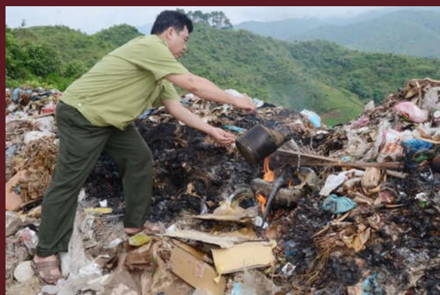
ENV strongly encourages enforcement agencies to routinely incinerate dead endangered wildlife animals, their products, or body parts. (Bac Kan FPD-R)

any criminal responsibility because although the overall number of animals is high (eight animals in total), the number of animals in each class doesn't meet the minimum requirement under Article 244 for prosecution (either three mammals of Appendix I CITES or seven reptiles of Appendix I CITES). However, if the same subject transports three giant pangolins (three mammals of Appendix I CITES), the subject will be prosecuted under Point (d) Clause 1 of Article 244 of the Penal Code because the subject's offense meets the minimum requirement for prosecution. This provision can be found in Article 6 of Resolution 05.