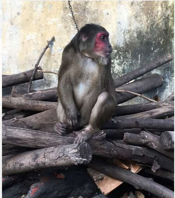
Eighty-seven macaques kept illegally as pets were seized in 2018.

On December 24, 2018, La Gi District FPD responded to a public report via the ENV Wildlife Crime Hotline and confiscated one stump-tailed macaque ( Macaca arctoides ). The macaque was released into the Ta Cu Nature Reserve the following day (Case ref. 13736/ENV).