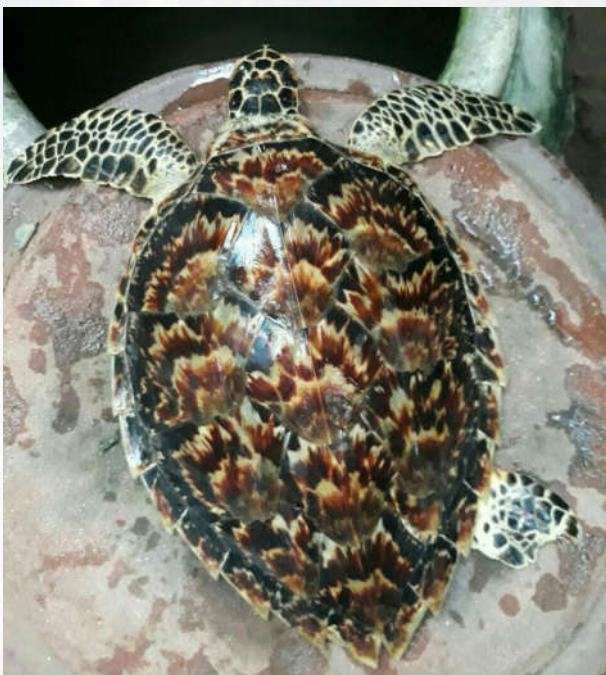
Captured Hawksbill turtles are often kept as pets.

On December 6, 2018, Ben Tre Fisheries cooperated with Ben Tre FPD to receive a hawksbill marine turtle ( Eretmochelys imbricata ) from a resident in Mo Cay Nam district. The man stated that he had caught the marine turtle the previous day and had called ENV to facilitate its transfer to the authorities. As a result of his action, the turtle was released back into the ocean (Case ref. 13681/ENV).