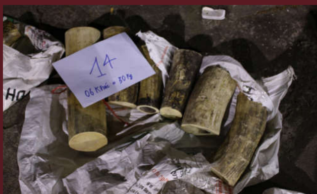
Ivory seizures like this, which weigh in excess of 2 kg, are now subject to prosecution under Resolution No. 05 if the ivory was obtained after January 1st, 2018.

For example, a subject steals 10 kg of elephant ivory, which costs 130 million VND, and sells it to another person and gets caught; the subject shall bear criminal responsibility for the act of stealing the ivory in addition to facing punishment under Article 244 for illegally selling elephant ivory. This provision can be found in Article 5 of Resolution 05.