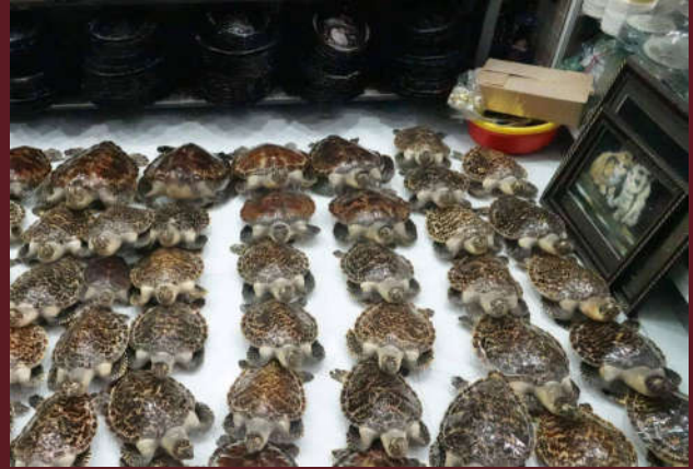
Resolution No. 05 defined hawksbill turtle trophies as "products" of hawksbill turtles.

The Resolution also provides clear guidance on handling wildlife crimes in some specific circumstances, such as possession of wild animals that were obtained before January 2018; wildlife crimes that coincide with other appropriation crimes; crimes involving multiple species from different protected lists, and appropriate disposal of confiscated wildlife, parts, and products.