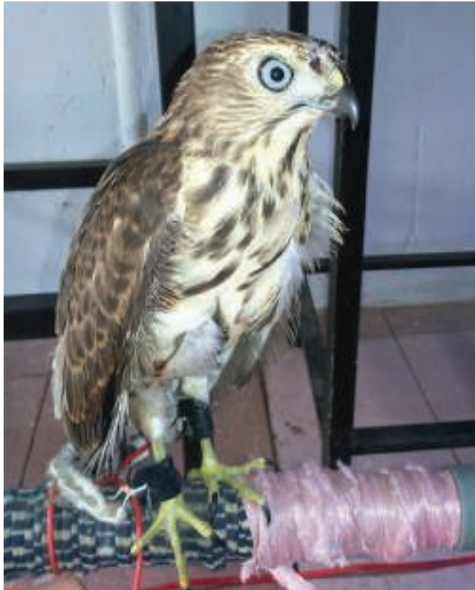
ENV Case no. 9956 A Japanese sparrow-hawk for sale in Dak Lak province.

On June 18, 2016, 22 Sunda pangolins ( Manis javanica ) were confiscated by Ninh Binh City Police from three subjects on a train at Ninh Binh train station. The pangolins were subsequently transferred to the Carnivore and Pangolin Conservation center at Cuc Phuong National Park (case ref. 9903/ENV)