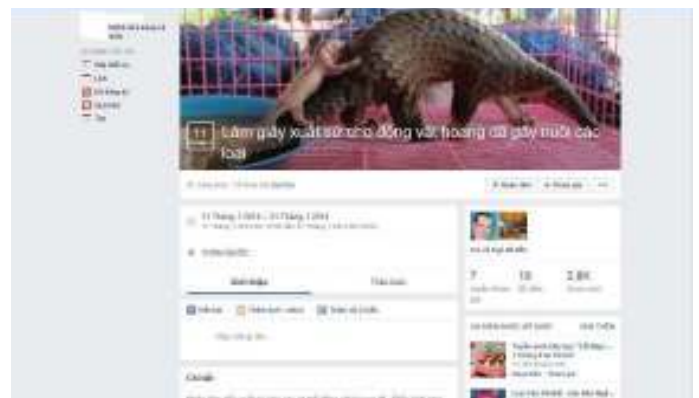
ENV Case no. 6200

Selling papers showing that animals are from legal origin at registered farms has become a business of sorts, resulting in widespread laundering of wildlife through legal facilities.