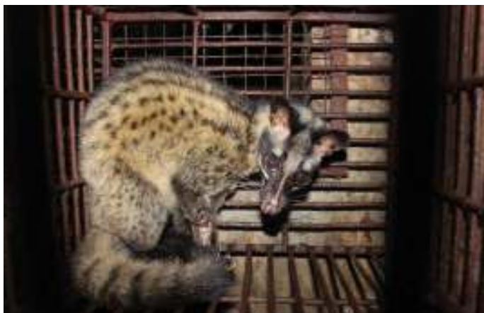
ENV Case no. 8716

A common palm civet with a snare wound being kept at a registered farm clearly shows that this animal originated from the wild and was not born on the farm as declared.