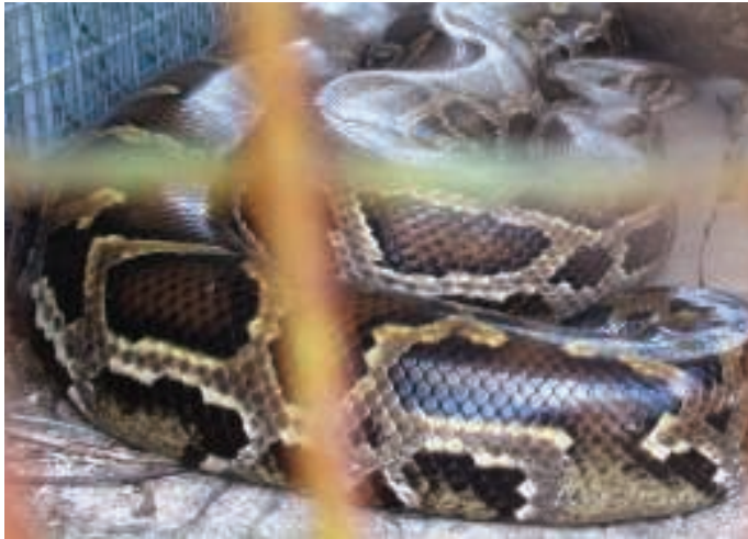
ENV Case no. 9525

On June 14, 2016, a day after ENV informed the Lac Son District FPD that a wildlife trader was operating from a restaurant in Hoa Binh province, the FPD confiscated two keeled box turtles ( Cuora mouhotii ), two live bamboo rats (unidentified) and three common palm civets ( Paradoxurus hermaphroditus ) from the restaurant. The subject was fined six million VND (US $277) and the animals were released into a nearby forest (case ref. 9874/ENV).