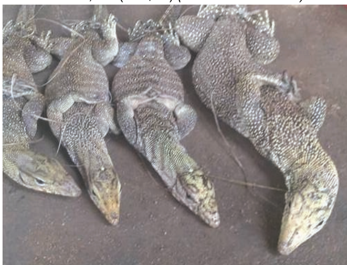
ENV Case no. 9886 Monitor lizards following capture by hunters await slaughter in Gia Lai province.

On August 3, 2015, ENV received a Wildlife Crime Hotline phone call from a member of the public who reported that a man was processing animal trophies and trading wildlife products in Dong Nai province including leopard cats, macaques and langurs. ENV reported the subject to the Dinh Quan FPD on August 5. On August 27, FPD officers searched the subject's house and confiscated two stuffed crocodiles. On February 3, 2016, ENV received a further report from the public that the same subject was producing leopard cat trophies for sale. ENV forwarded the information to the FPD. On May 9, 2016, the FPD searched the subject's house and confiscated 20 stuffed crocodiles and a stuffed monitor lizard. The subject was fined VND 750,000 (US $40) (case ref. 8751/ENV).