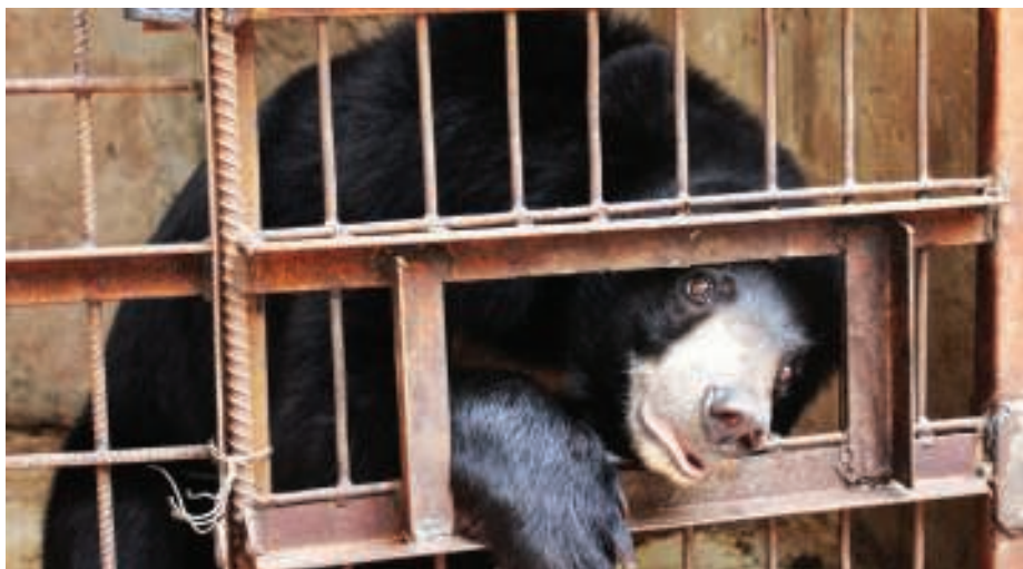
ENV Case no. 9356

Is tiger farming the next disaster in the making? More than 4,300 illegal bears accumulated on farms under the noses of authorities prior to 2005. Efforts to correct this substantial failure of wildlife protection authorities continue today with at least 1,300 bears still on bile farms.