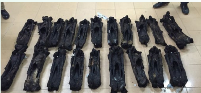
Bones of 20 black-shanked douc langurs found on a bus in Ha Noi

The bones of 20 black-shanked douc langur ( Pygathrix nigripes ) were found by traffic police on a bus travelling through Soc Son district on January 28. The driver was not charged and police are currently investigating the incident to find the owner. Smuggling wildlife by