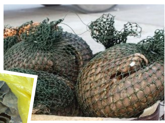
A shipment of pangolins confiscated in Thanh Hoa province

Crimes involving the Chinese pangolin ( Manis pentadactyla ) and the Sunda pangolin ( Manis javanica ) shall be prosecuted according to Article 190 of the Penal Code regardless of quantity, quality or value of the items confiscated. This requirement has been confirmed by all relevant authorities including the Government office, MPS, MARD, and MONRE. In addition, NO AUCTIONING OF CONFISCATED PANGOLINS IS PERMITTED. Pangolin confiscations shall be dealt with as follows according to existing regulations: