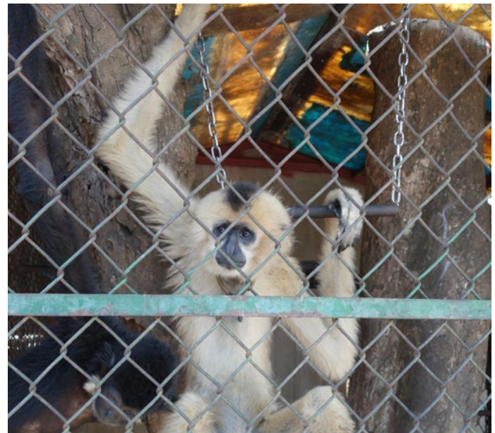
A gibbon, transferred to Cu Chi rescue center after being kept for a long time by a local resident of Ba Ria - Vung Tau

In January, information passed through ENV's hotline resulted in the seizure of a frozen tiger as it was delivered to a hotel where it was to be cooked to make tiger bone TCM. The tiger weighed 303kg and was cut into five pieces. Two bags of animal bones weighing 53kg, three kg of turtle shell, and firearms were also recovered by police. The tiger trader was arrested and the case is awaiting prosecution (Case ref. 7920/ENV).