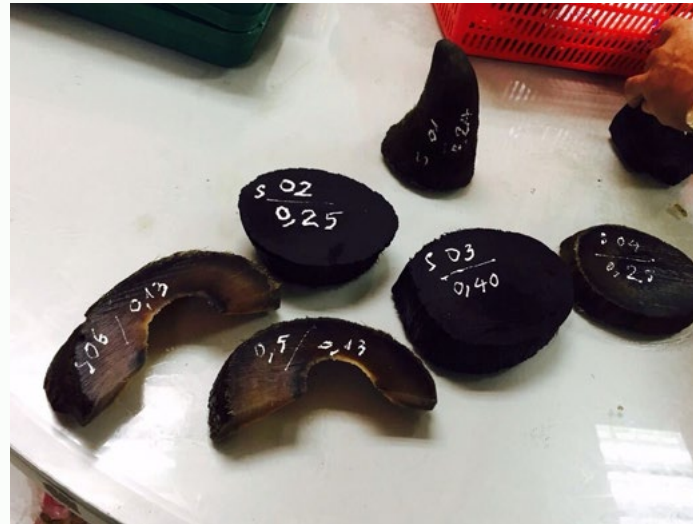
1.39 kg of rhino horn hidden inside the heads of lobsters, confiscated at Tan Son Nhat Airport

The owner of a restaurant in Hai Phong agreed to transfer a black kite ( Milvus migrans ) and an eagle to the Hai Phong Forest Protection Department, after they came to check the site following a report through ENV about a number of illegal birds being kept at the restaurant. The birds were subsequently released to Cat Ba National Park (Case ref. 7822/ENV).