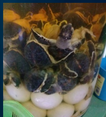
Hatchling marine turtles and marine turtle eggs in wine. Today, with only a few marine turtle nesting beaches remaining in Vietnam, it is time for authorities to take marine turtle crimes seriously and enforce the law to protect all five native species.