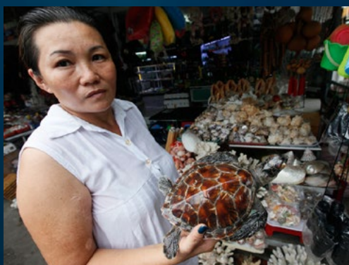
Selling a marine turtle as a trophy seems like a passive violation. However, thousands of turtles are sold this way as decorations, representing a substantial threat to the species. Letting this woman off with a warning is only effective if the turtle is confiscated and authorities ensure that she will never engage in such illegal business again.