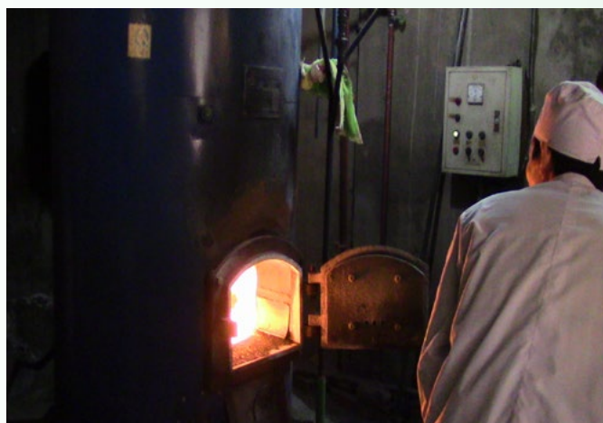
Thanh Hoa authorities destroy Tiger bone TCM following confiscation

When a small Indian civet ( Viverricula indica ) was advertised for sale online on March 12, ENV coordinated with the Bao Lam district Forest Protection Department to arrange a meeting with the owner, who thought they were interested in buying the animal. When the meeting took place, Forest Protection Department surprised them by confiscating the civet, which was later released to local forest (Case ref. 8076/ENV).