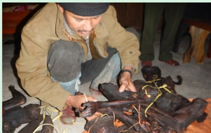
A langur trader caught with dried Ha Tinh langurs in Quang Binh. The dried langurs are used to make a form of traditional medicine

According to Decree 40/2015/NĐ-CP, species listed in Decree 160/2013/NĐ-CP as endangered, precious and rare species prioritized for protection are not to be treated within Decree 157's scope of application. This means violations involving any species listed in Decree 160/2013/NĐ-CP are to be treated as criminal offenses