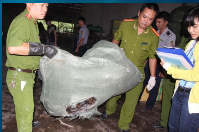
In late 2014, authorities raided six warehouses in Nha Trang, recovering more than 10 tons of dead marine turtles. Thousands of endangered hawksbill marine turtles were found, making this the largest single confiscation of marine turtles in history.