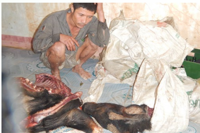
Serow meat and parts seized in Quang Binh